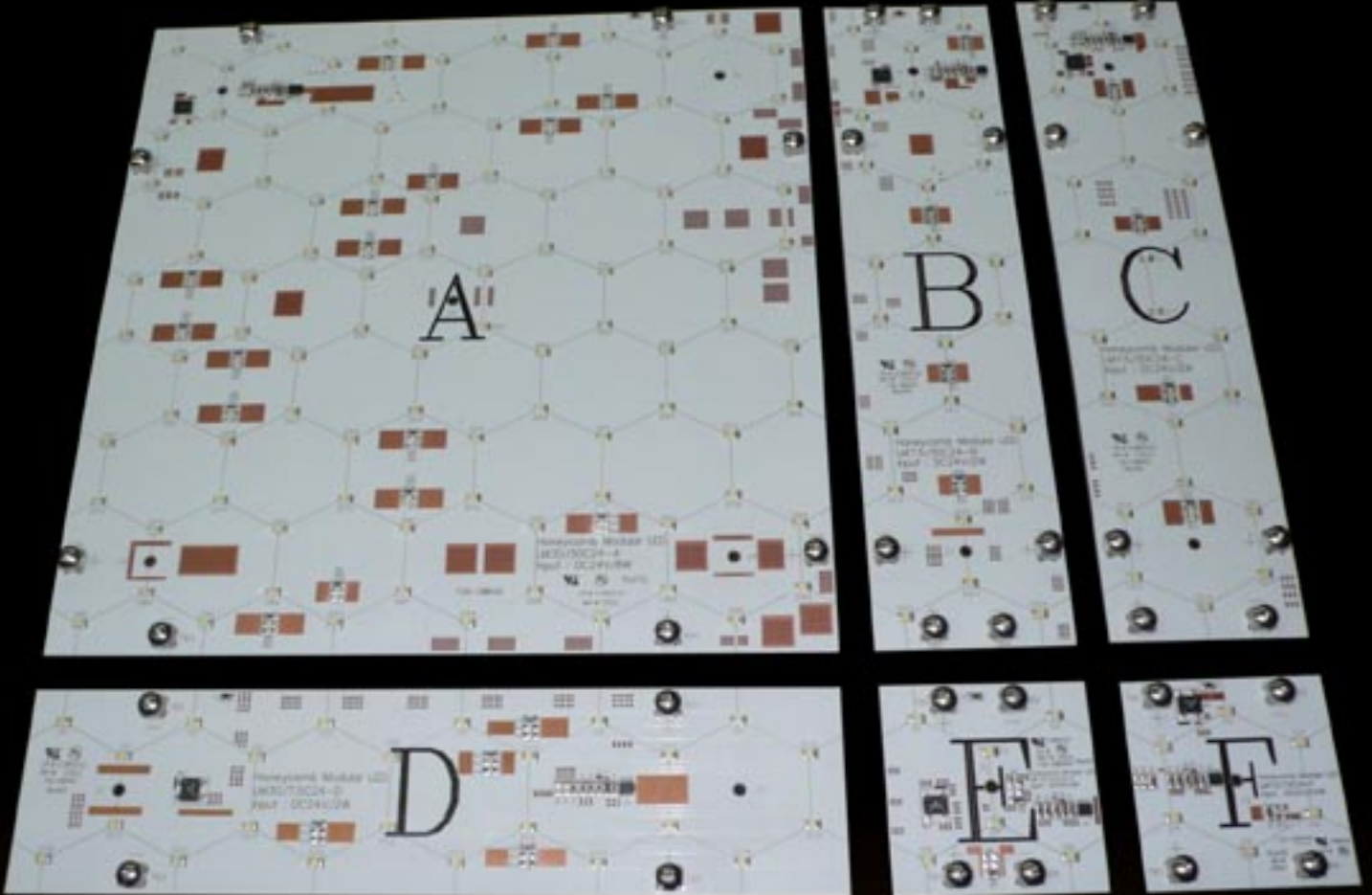
LM 7.5/30C 24-D